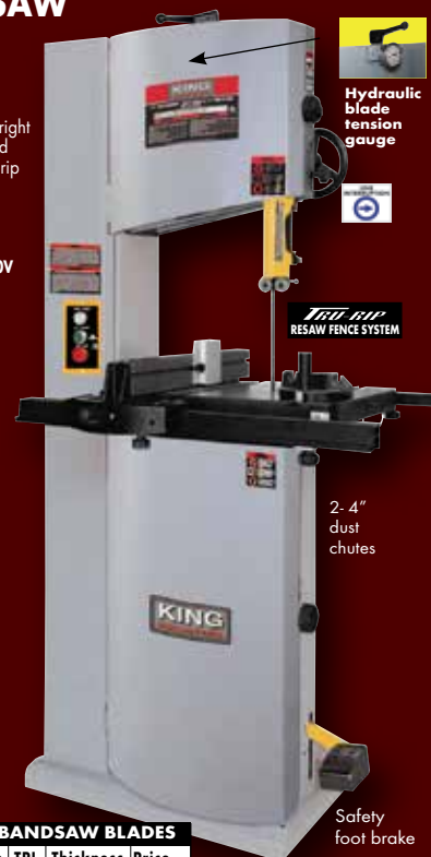
Hydraulic blade tension gauge