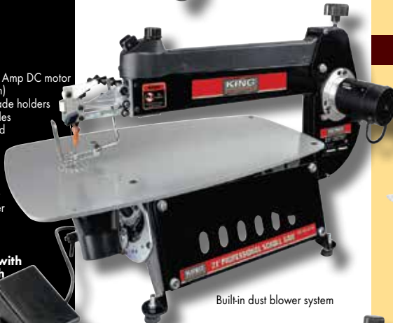
Built-in dust blower system