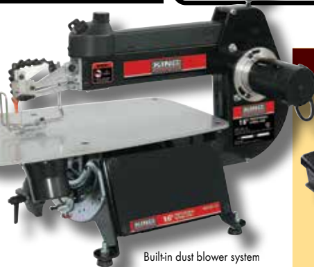
Built-in dust blower system