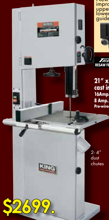
2-4" dust chutes

21" x 21" cast iron table 16Amp. @ 110V - 8 Amp. @ 220V Pre-wired to 220V