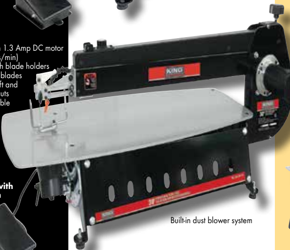
Built-in dust blower system