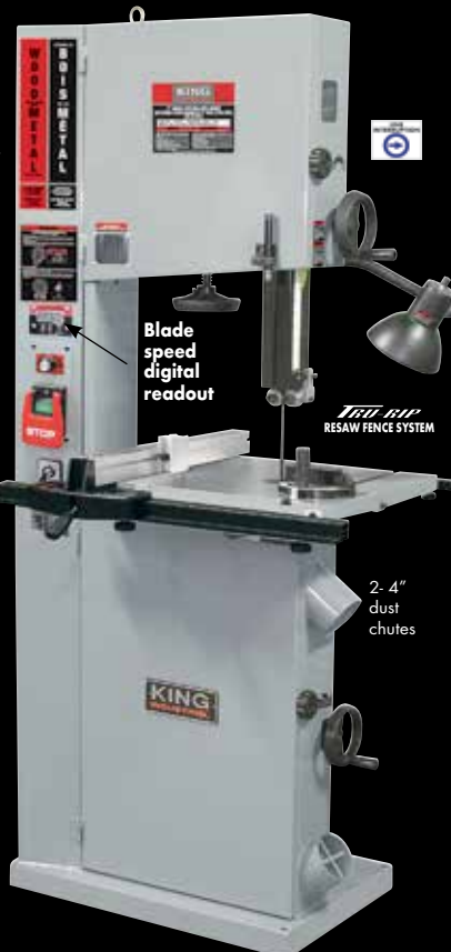
TRU-RIP RESAW FENCE SYSTEM