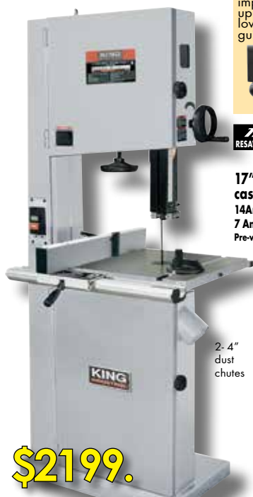
2-4" dust chutes

17" x 17" cast iron table 14Amp. @ 110V - 7 Amp. @ 220V Pre-wired to 110V